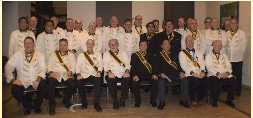
Knights of Rizal - Diamond Chapter - 2016