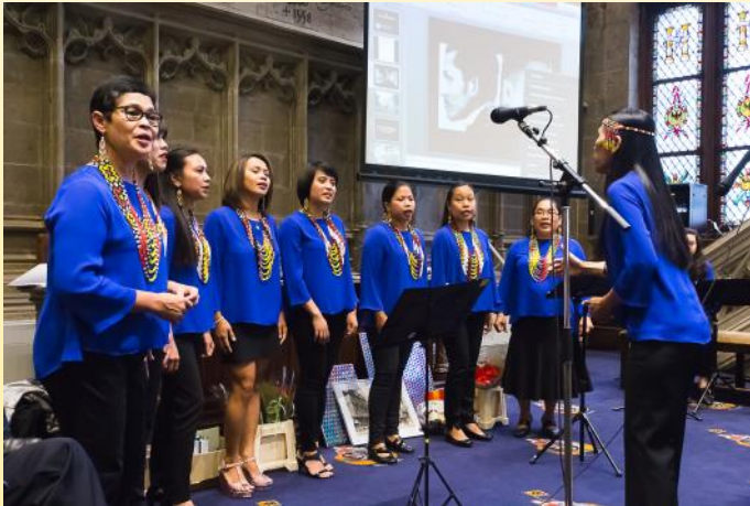
The Pag-Ibig choir

In between the lectures, the public was entertained by the Pag-Ibig choir of Ghent.