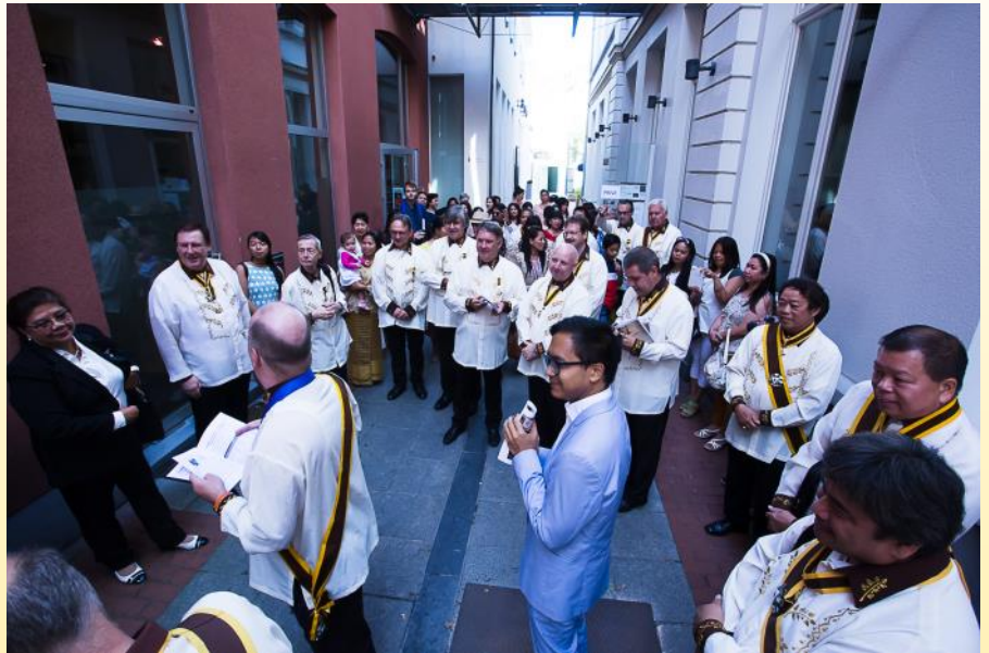
The participants leaving the restaurant for the flower offering

The guests were welcomed in the restaurant 'De Abt' at 10 am. Thanks to the overwhelming response, we could welcome not only the other 4 Belgian Chapters - Aalst, Brussels, Charleroi and El Filibusterismo Belgium but also delegations from Germany, Italy, France and the Netherlands. The Las Damas came with a large delegation from Belgium and France and also the ladies of the Kababaihang Rizalista were present.