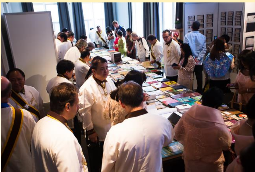
A view at the expo