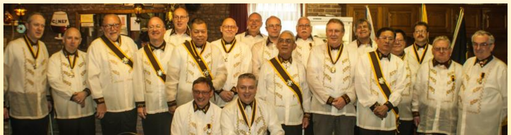
Knights of Rizal - Diamond Chapter - 2015