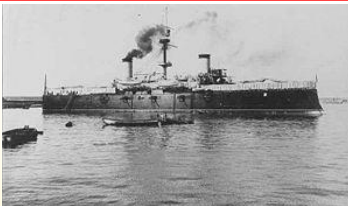
Spanish cruiser Crisobal Colon

Finally, on 3 September 1896, Rizal departed from Manila for Spain on board the ship Isla de Panay. When he landed in Spain on 6 October 1896, Spanish soldiers brought him straight to the prison castle of Montjuich in Barcelona. A military officer informed Rizal that various newspapers in Madrid identified him as one of the leading conspirators of the revolution in Filipinas. After being detained for eight hours, he was deported back to the colony on board the boat S.S. Colon. His chances of reaching Cuba vanished. Rizal arrived in Manila on November 3 and was immediately imprisoned in Fort Santiago.