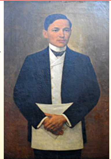
Rizal in the Freemason costume

Rizal's El Filibusterismo was published in September 1891, and in October he departed for Hong Kong. There he enjoyed a delightful reunion with family members. He wanted to return to Manila but desisted in view of the controversy his books had generated, especially his second, El Filibusterismo . While in Hong Kong, Rizal developed an extensive and lucrative medical practice. Meanwhile, a Lodge for Filipinos, Nilad No. 144, had been established in Manila. The Lodge membership honoured Rizal in absentia by electing him "Honourable Venerable Master" and had the Secretary inform him by letter of his preferment.