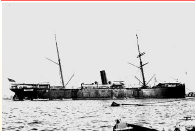
Isla de Panay