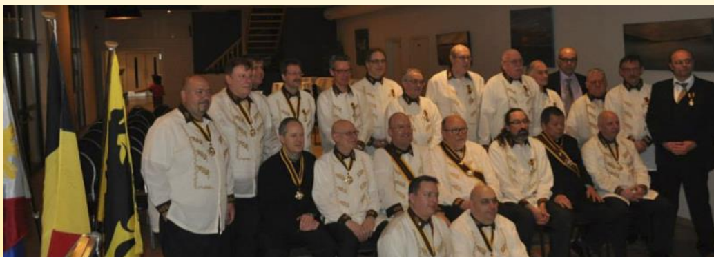
Knights of Rizal - Diamond Chapter - 2014