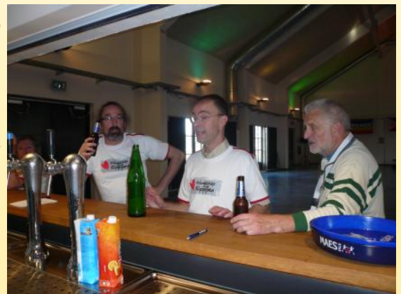
A few volunteers

You are all kindly invited on the 12 th anniversary and fundraising for Friendship for the Philippines on Sunday September 28, 2014 at 12.30 p.m. at Jeugdhuys 't Verzet, Duinenwater 45, Knokke-Heist. Please note the date in your agenda! Thanks for the support of KOR Diamond!