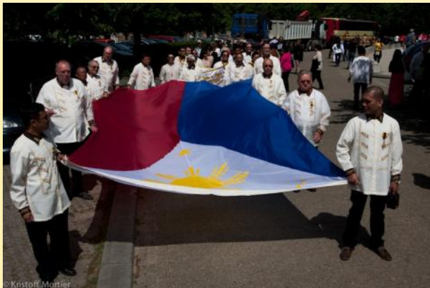
Philippines Independence Day Brussels