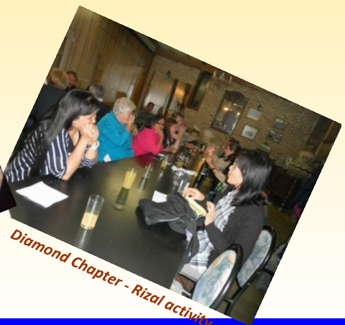
Diamond Chapter - Rizal activity