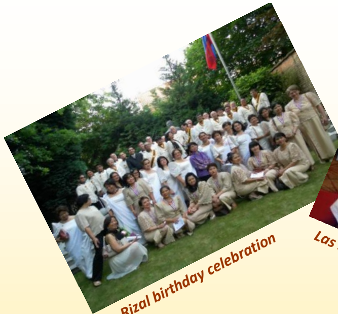
Rizal birthday celebration