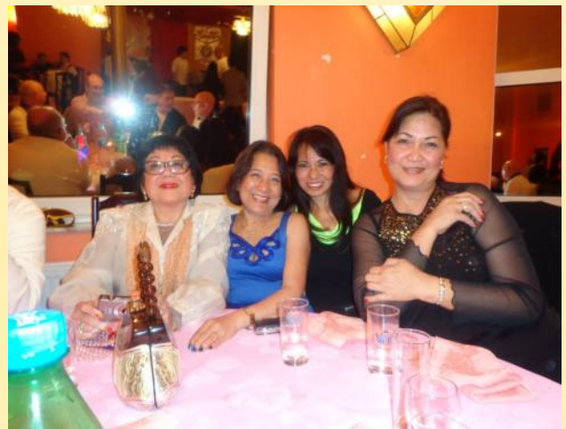
Carleroi Chapter - Dubbing