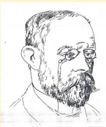
Sketch of Blumentritt

After Rizal had published his ' Noli ' in Berlin aided by Maximo Viola, he visited Ferdinand the first and only time these great friends acted on 13 th May and left Leitmeritz again on 17 th wanted to visit Blumentritt again but never do so. Rizal invited Blumentritt to the Philippines but he never managed to make that trip either. On the day of his departure, Rizal made a gift to his great friend of a sketch of Blumentritt. A few days after their departure Blumentritt wrote: " I am at heart a Leitmeritzian, just as you yourself are a Filipino. " (Letter 19 th May 1887)