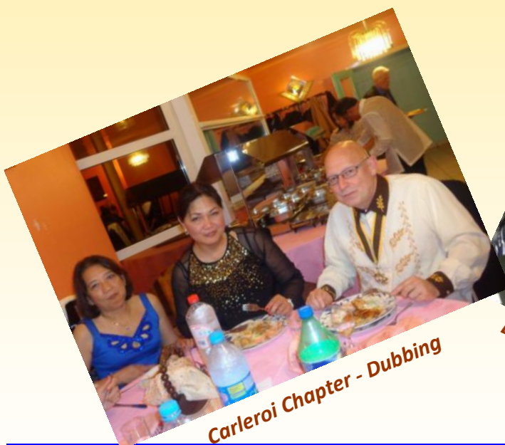
Carleroi Chapter - Dubbing