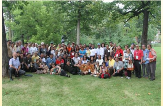
Some of the delegates at the Rizal monument

During the evening the delegates attended the 14th Commanders Ball and Entertainment Night.