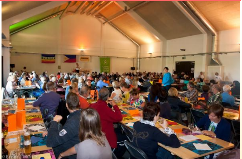
View of the participants