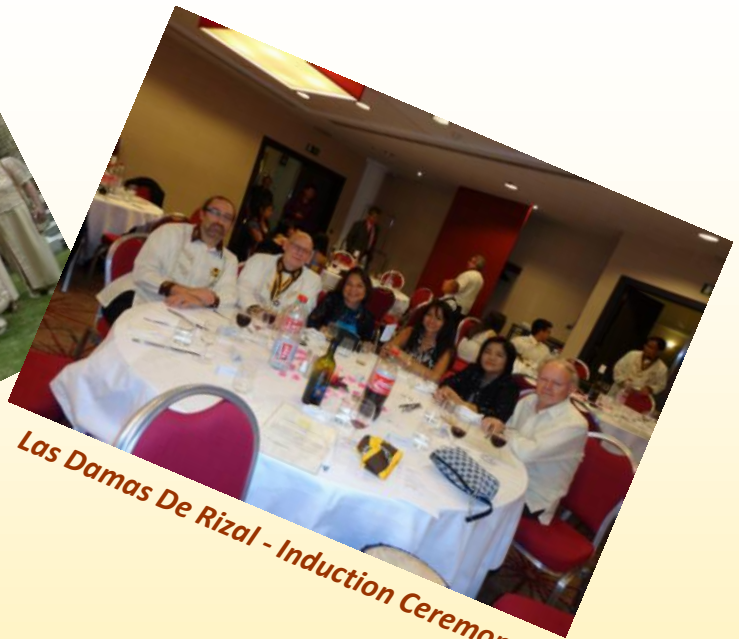
Las Damas De Rizal - Induction Ceremony