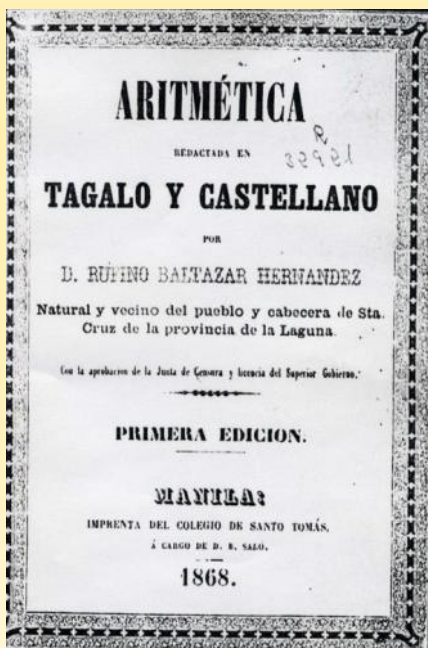
The book Aritmética