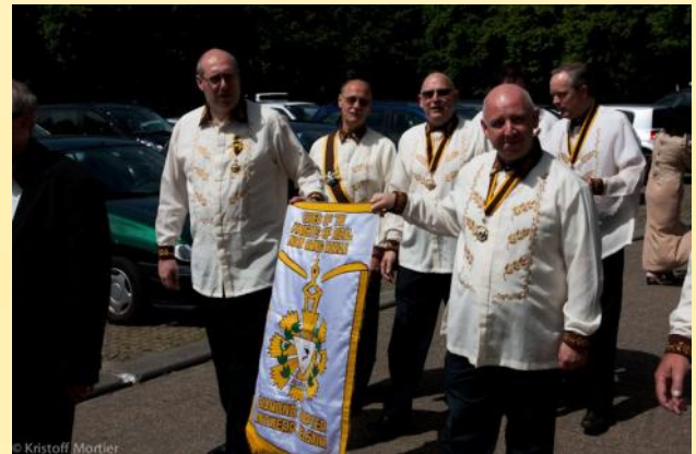
Philippines Independence Day Brussels