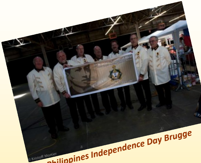
Philippines Independence Day Brugge