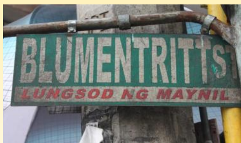
Blumentritt street in Manila

The Philippines also honoured Blumentritt in many ways for his efforts on behalf of the country. In Manila there is a Blumentritt street, a railway station, an LRT station, a jeepney route, a bank, a mosque, and several shops named after him. All over the islands you can also find other Blumentritt streets.