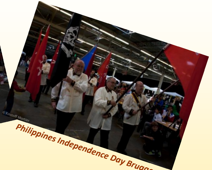
Philippines Independence Day Brugge