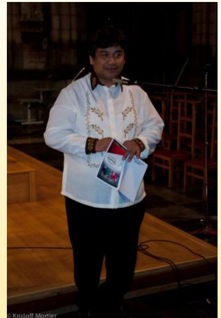
Sir Abeth Arevalo