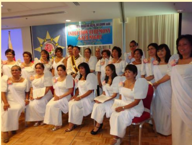
Las Damas De Rizal - Induction Ceremony