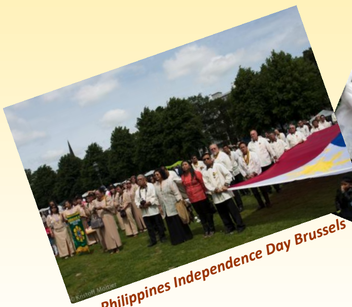
Philippines Independence Day Brussels