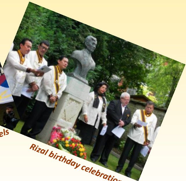
Rizal birthday celebration