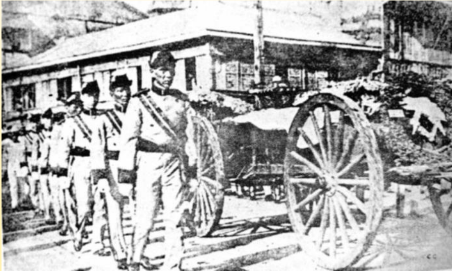
The original ceremony for the transfer of the mortal remains of dr Rizal