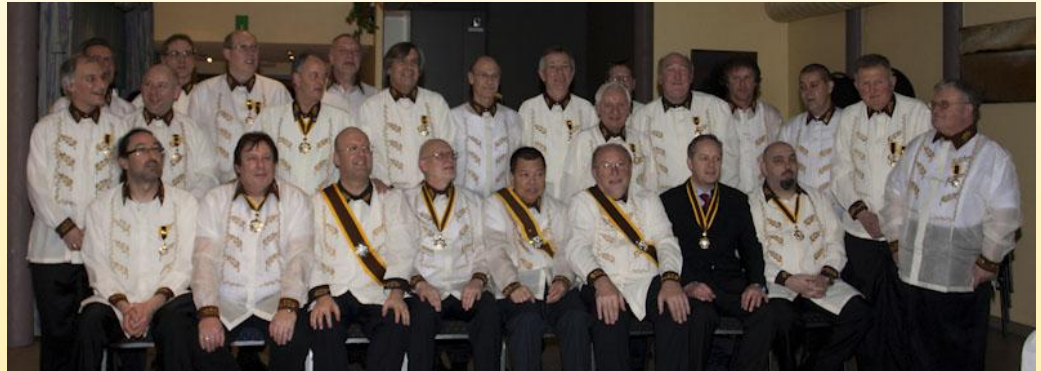
Knights of Rizal - Diamond Chapter - Jan. 2012