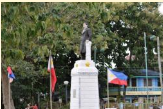
Statue of J. RIZAL in Puerto Princesa - Palawan