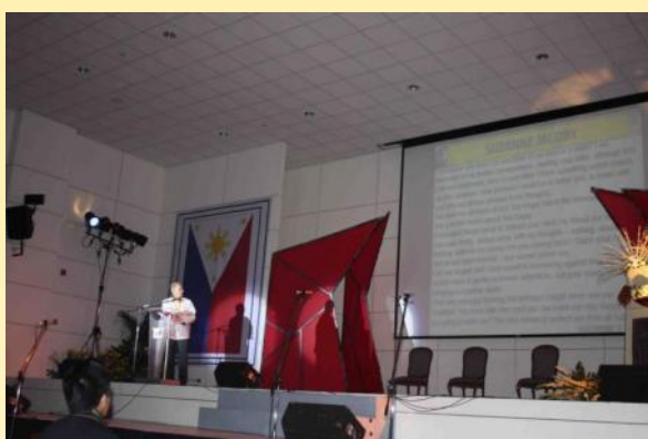
Rizal presentation at UP Diliman auditorium