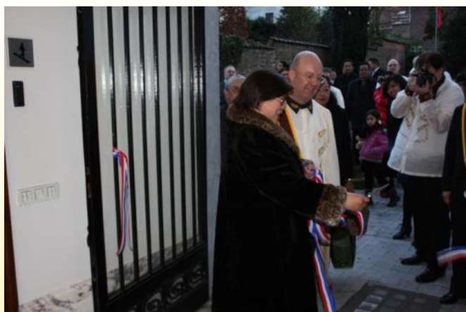
Opening of the René Robles Painting exhibit

After the ceremony the René Robles Painting Exhibit on Rizal