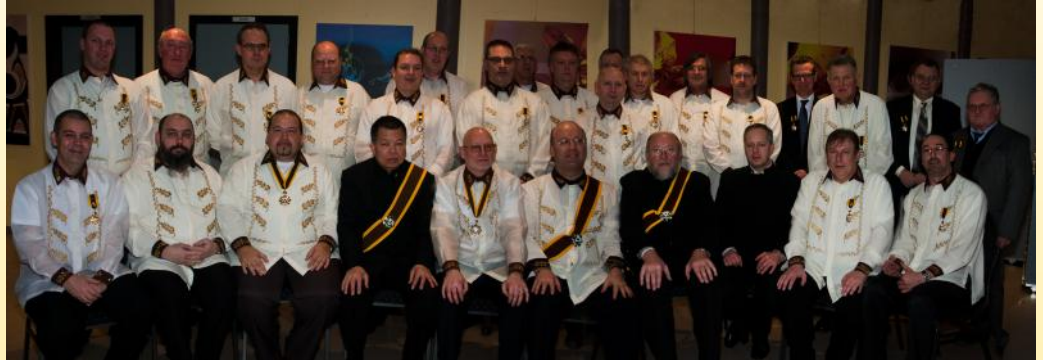
Knights of Rizal - Diamond Chapter - Jan. 2011

Diamond Chapter Antwerp—Flanders—Belgium