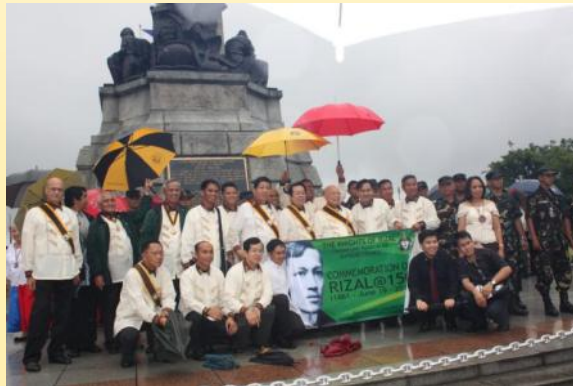
Knights of Rizal