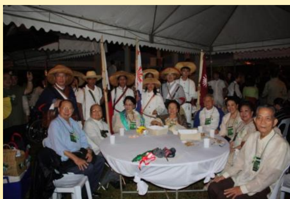
ARizal family table