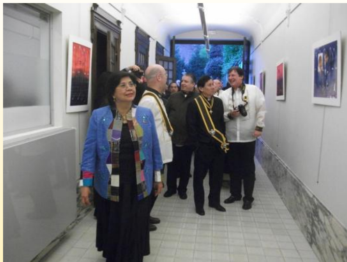
The René Robles collection

After the ceremony the René Robles Painting Exhibit on Rizal