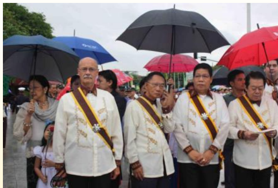
Knights of Rizal

We joined with a number of other Knights of Rizal who laid a rose at the statue of Rizal