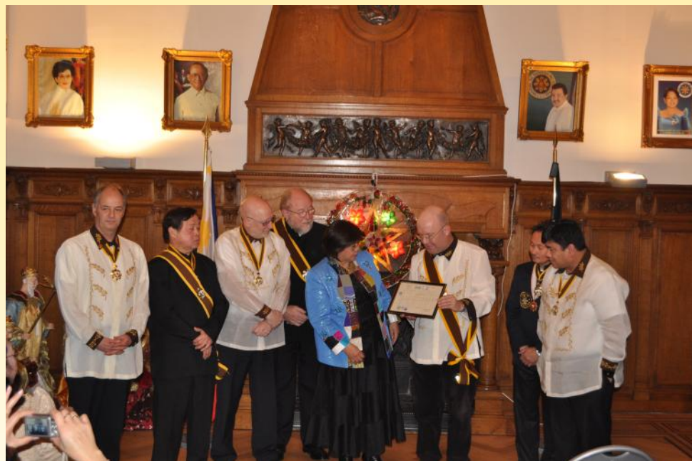
Sir Dominiek offers a copy of the civil registrar to H.E. Victoria Bataclan

A frame with an on special paper Xeroxed copy of the civil registrar of Brussels stating the living of Rizal in Brussels 1890-