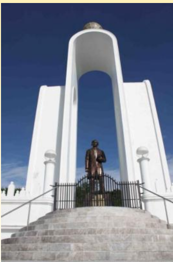
Sir Asfour's Rizal statue in Bayombong

After breakfast we were driven to this magnificent 7.3 hectare complex, located in Barangay Casat, with its huge new monument and 16 metre statue of Rizal, surrounded by arches containing busts of other historical Filipino heroes, including one to the 'unsung' and unknown heroes