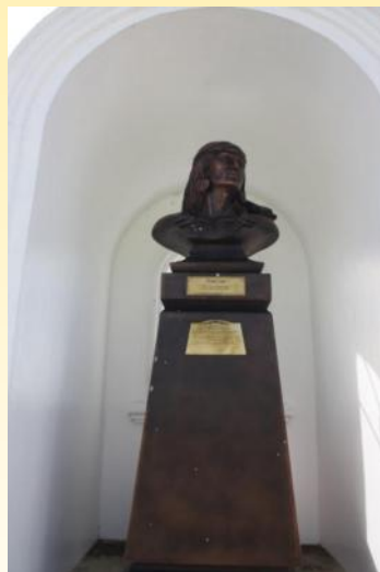
Bust Lapu Lapu