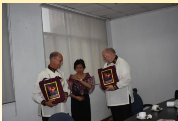
Memento to take home

After lunch with the Bantug family I surprised them with a two hour presentation on Dr. Rizal.