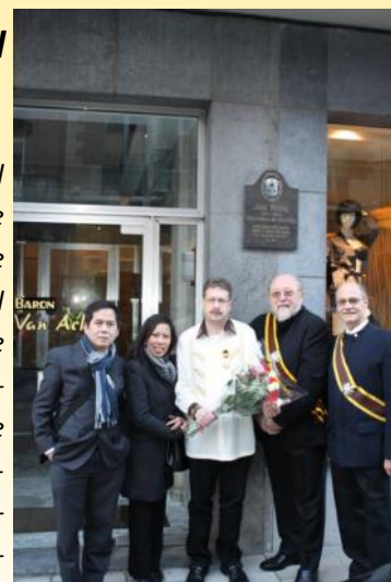
Flower offering in Gent