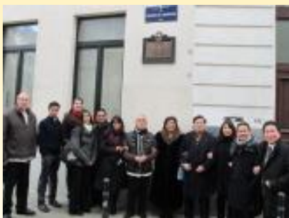
Flower offering in Brussels