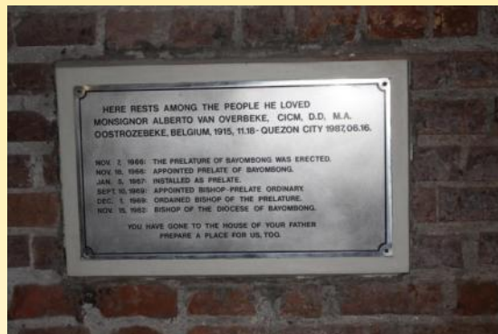
Plaque Bishop Van Overbeke