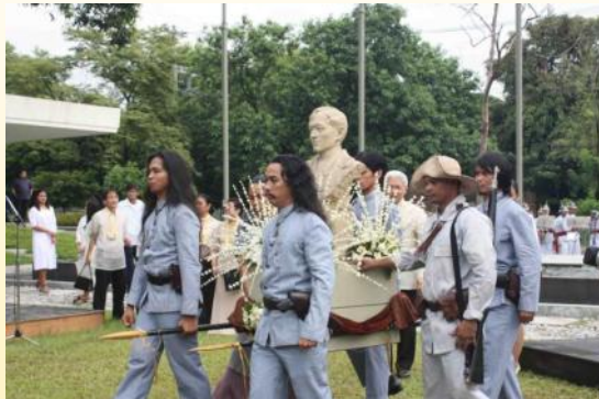
Raising of the flag by the Bandoleros Bandoleros solemnly marches with Rizal's bust