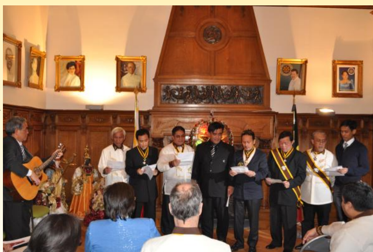
Performance of the KOR Brussels