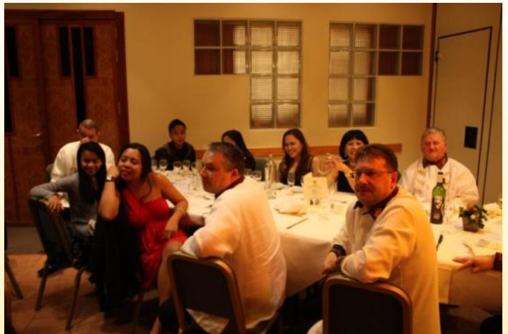
A view of the dinner buffet

Sir Cris Pinkihan flowered the evening with Philippine and other songs of pop, jazz, crooners. Sir Dominiek produced his own version of the song My way of Frank Sinatra and dancing a go-go followed. Closing remarks by Sir Dominiek and Ambassador Bataclan ended the beautiful evening a bit before midnight.