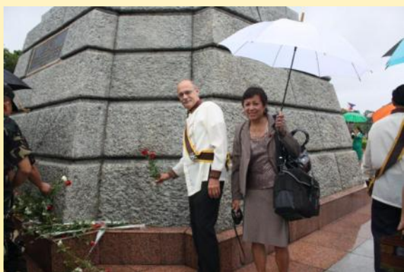
One of the 100 red roses

We joined with a number of other Knights of Rizal who laid a rose at the statue of Rizal