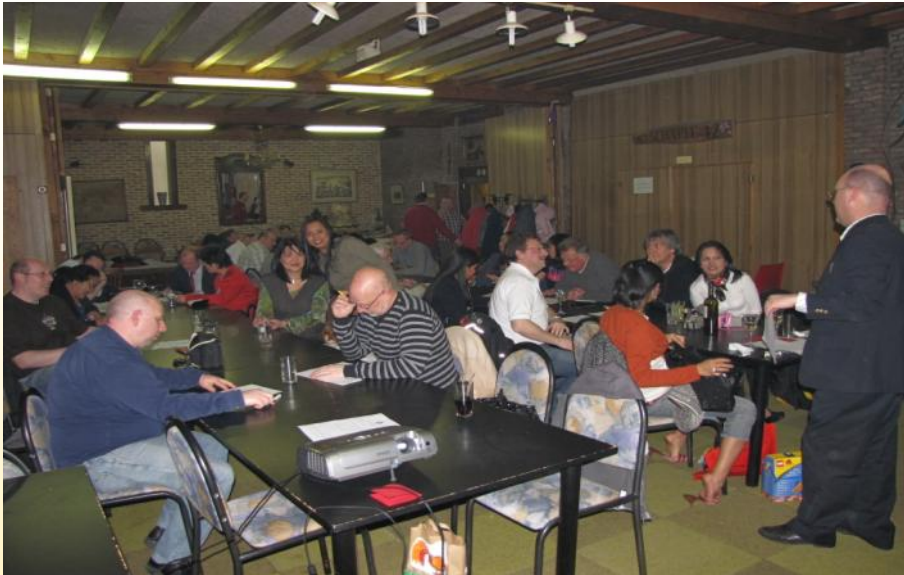
The participants to the quiz