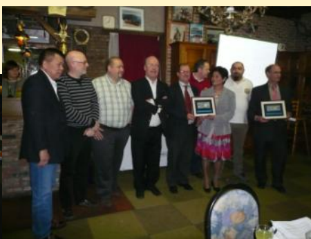
The winners congratulated by our board