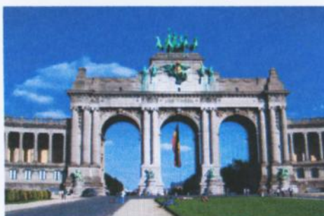
Parc du Cinquantenaire / Jubelpark Brussels Centrum (Near Metro Schuman & EEC) June 14, 2009, Sunday, 8:00 a.m. to 7:00 p.m.