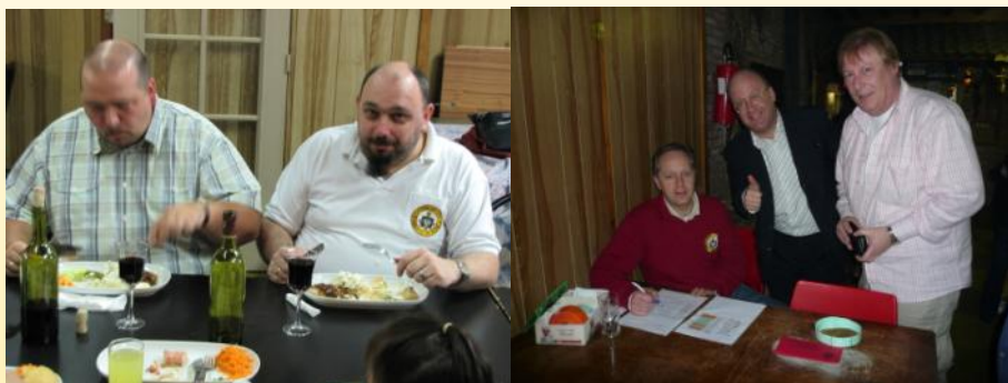
An action picture of the bbq