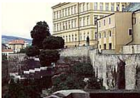
The RIZAL Wall in Prague and