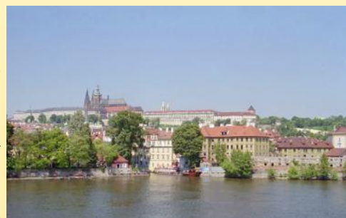
View of Prague and the castle

The moment we have an idea of how many interested KOR of our Chapter there are, we could ask for a package. As for know, booking a flight to Prague for the Assembly is on an individual base.