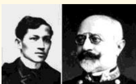
José Rizal (1861-1896) and Ferdinand Blumentritt (1853-1913)