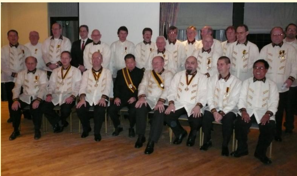
Knights of Rizal – Diamond Chapter – Jan. 2009