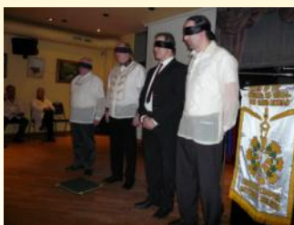
The 4 new Knights of Rizal during the dubbing ceremony