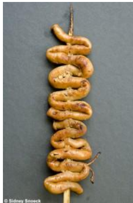
8 = A.lud