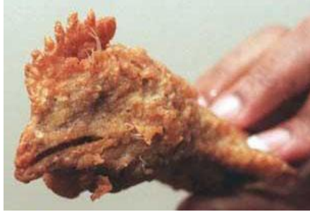
2 = E.Helmet