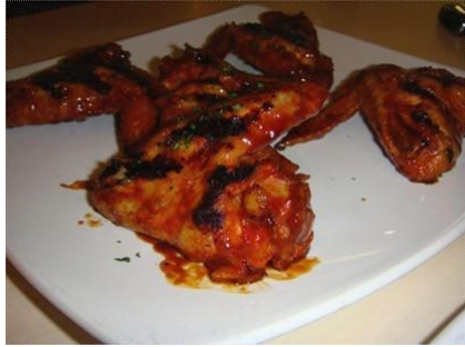
1 = D.Pal