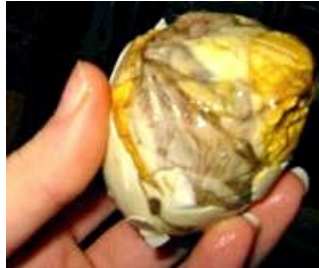
5 = G. Balut