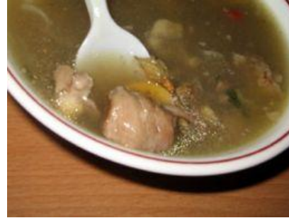
3 = H. Soup n° 5