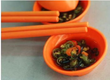
4 = I. Day-old